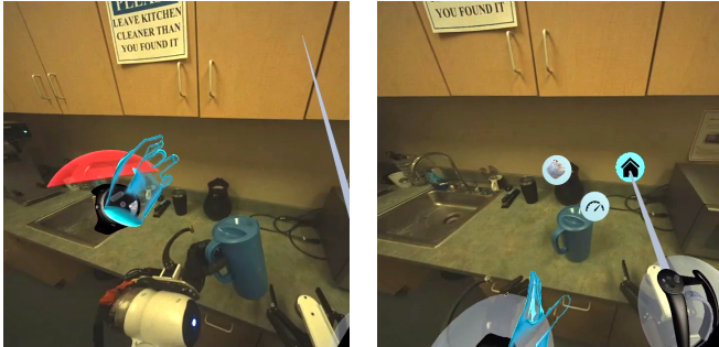
Fig. 3: (Left) View from the operator’s perspective, showing force-feedback spheres while lifting a heavy object. (Right) Heads-up display menu enables semi-autonomous functionalities: arm “homing” (right), texture-sensing mode (left), and base speed adjustment (center) icons.

navigation: a toggable birds-eye view camera system lets the operator see obstacles to the sides and behind the robot, while ultrasonic proximity sensors warn the operator of any imminent collision risks through directional auditory cues.